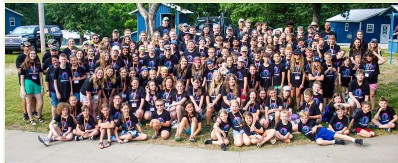
This year's theme verse was Luke 10:18-19 “And he said to them, “I saw Satan fall like lightning from heaven. Behold, I have given you authority to tread on serpents and scorpions, and over all the power of the enemy, and nothing shall hurt you.” LEFT: Spark Kids Camp (grades 3—6) RIGHT: Ignite Youth (grades 7—10)

Thank you, churches, for sending your kids! If your church has kids but hasn't sent them to camp, just know: God is blessing Tri-County's camps and we'd love to see your kids with us on “the Hill” next year! If you're an adult and are interested in being part of “the cheapest mission trip you'll ever go on,” come join us—we need you! Camp dates for next year are June 3-6, 2024.