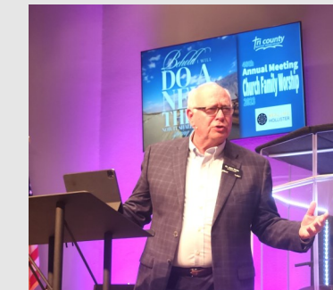
THE SAINTS ASSEMBLED (left): Believers from 21 churches from 3 counties worship together.