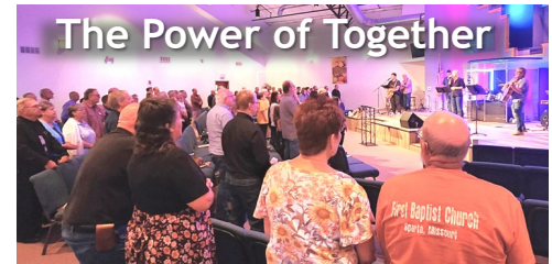
GETTING BLESSED; BEING A BLESSING: Tri-County Baptist Association's 48th Annual Meeting and Church Family Worship .

Believers from 21 churches spread across Taney, Stone and Christian Counties gathered on October 1 at Real Life Church Hollister for Tri-County Baptist Association's 48th Annual Meeting and Church Family Worship. Messengers from the churches heard how the Lord is working through the Association, approved our 2024 spending plan and leadership, and voted to enter into a missions partnership with People of God Baptist Church in Mexico. Real Life Church hosted in an excellent and gracious fashion. Many sensed a special spirit that night. "Behold, how good and how pleasant it is for brethren to dwell together in unity!"